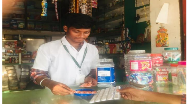
COMMUNITY PHARMACY TRAINING