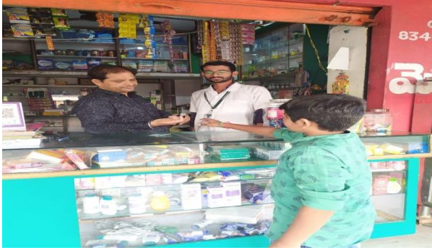
COMMUNITY PHARMACY TRAINING